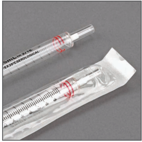
The individually wrapped pipettes are sold sterile in easy-toopen polyethylene/medical grade paper peel packs.