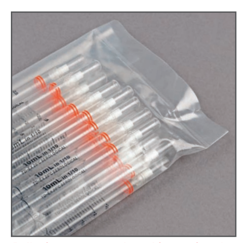
Bulk pipettes are packaged in 25-piece bags and are available sterile or non-sterile. (The 50mL bulk pipettes are available in sterile only.)