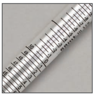
Reverse and negative graduations on all volumes