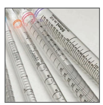
Crisp and bold easy-to-read graduation marks